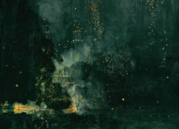
7 Groveland Township Fire Station One 200 Municipal Drive, Holly Nocturne in Black and Gold, the Falling Rocket James Abbott McNeill Whistler