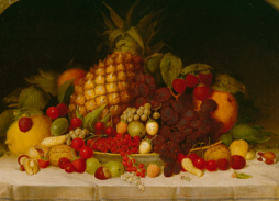
8 Edna Burton Senior Center 345 Ball St, Ortonville Fruit Piece , Robert S. Duncanson