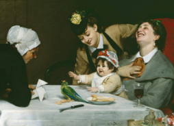
4 Whiskey River Bar & Grill 16853 Dixie Hwy, Davisburg Merrymakers , Carolus-Duran