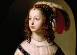
5 Michigan Renaissance Festival 12600 Dixie Hwy, Holly Portrait of Princess Sophia, Princess Palatine Gerrit van Honthorst