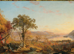
3 Bueches Food World 400 N Ortonville Rd, Ortonville Indian Summer , Jasper Francis Cropsey